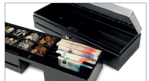
Robust and secure metal housing