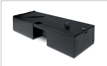
Safescan 4617CL Lockable lid Art. no: 121-0571