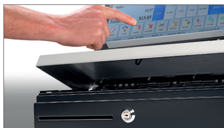
Easy to combine with existing cash registers and POS environments