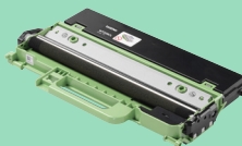
Waste toner box WT229CL