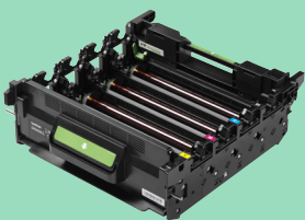
Drum unit DR625CL